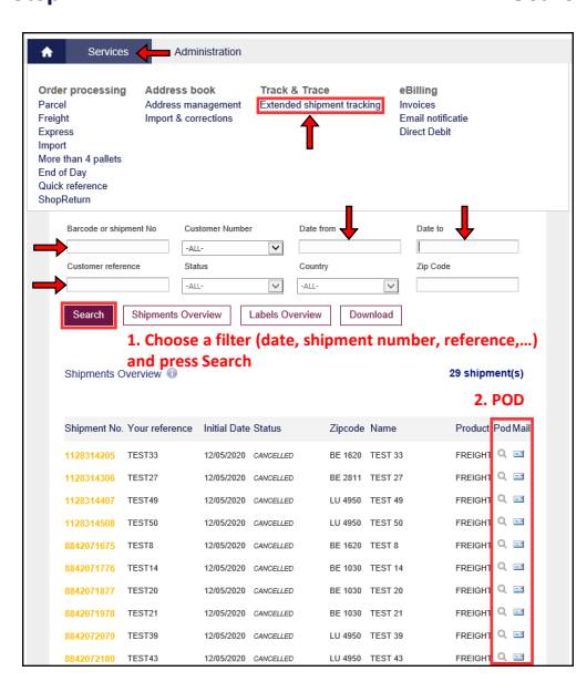
Step 1: Fill out the search criteria and click on "Search".

Step 2 : Through the magnifying glass ("POD" column) you can view the proof of delivery, it is also possible to optain this information by mail (see the "Mail" column).