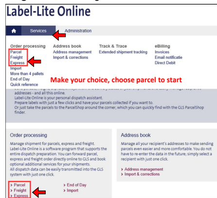
Click on "New Order"